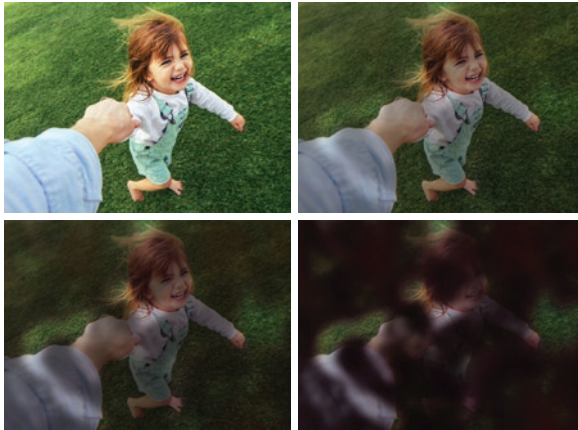
Figure 2. Vision with progressing DR. 3

Eye exams are part of managing your diabetes. Early detection and treatment of DR can reduce the risk of blindness by 95 percent. 2