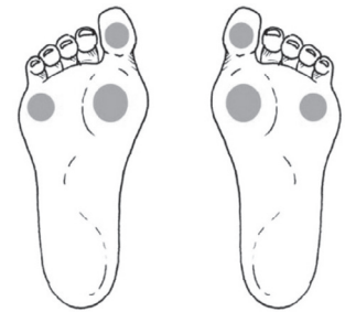
Figure 1. Sites to be tested with the monofilament

N. C. Schaper NC, Van Netten JJ, Apelqvist J, et al. Prevention and management of foot problems in diabetes: a Summary Guidance for Daily Practice 2015, based on the IWGDF Guidance Documents. Diabetes Metab Res Rev 2016; 32(Suppl. 1): 7–15.